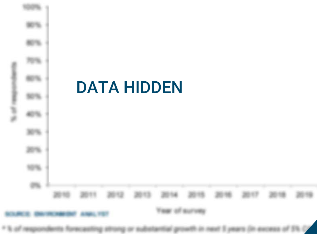
Fig 21 Revenue prospects across third 4 of 12 service areas, comparison 2010-2019