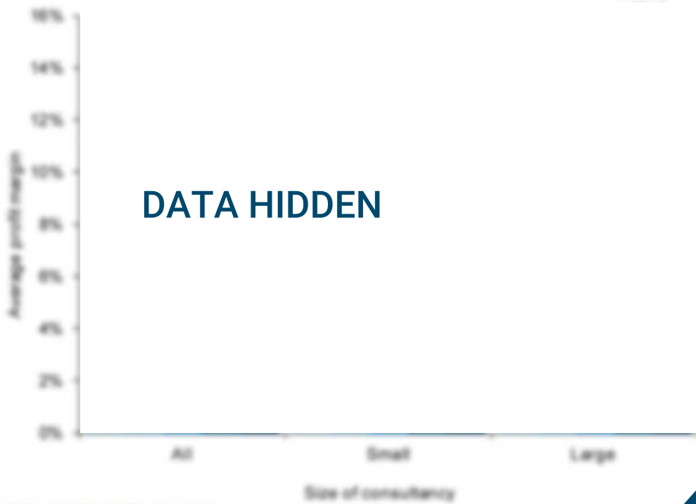
Fig 9 Average mean profitability (based on pre-tax or operating margins), 2015-2019e