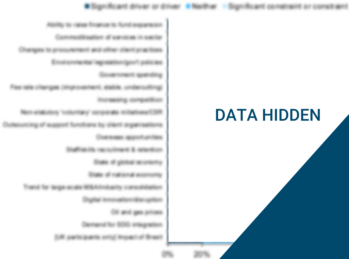
Fig 36 Strategic business drivers for next 5 years

This section provides a summary of the market trends survey results relating to the main business drivers and pressures for environmental consultancies operating in the UK. In the survey, respondents were asked to identify which drivers, disruptors and risks will have more or less impact on their business and market demand over the next five years (see figures below).